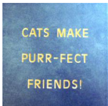
example of 8 x 8 tile

8" x 8" Tile: up to 5 lines, 14 characters per line: